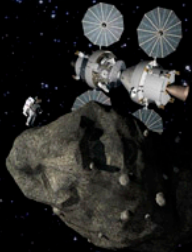
2019 Explore asteroid 2008 EA9 12 million km from Earth 195 days