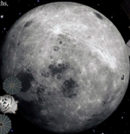
2018 Explore the Moon's far side from the Earth-Moon L 2 point 450,000 km from Earth 35 days