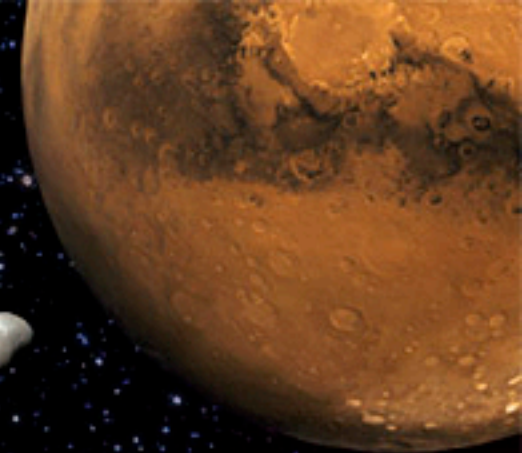
2031-2035 Explore Deimos in Mars orbit 900 days

In the mid 2030's astronauts can take advantage of a rare opportunity to more easily visit the moons of Mars. The lowest delta-V mission opportunities in the 15-year Earth/Mars orbital mechanics cycle will coincide with the phase in the 11 year solar activity cycle when the Sun provides the most protection from galactic cosmic rays. Using the capabilities for telerobotic operation and long duration deep space exploration pioneered by the Lunar Farside and asteroid missions, astronauts can visit Deimos and control rovers on the Martian surface to collect samples from locations of possible biological interest. Sending the first astronauts to Mars orbit rather than to the surface avoids the need for a variety of difficult technologies such as advanced propulsion, atmospheric entry and landing, and biological containment.