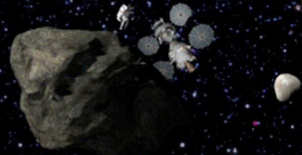
2029 Explore asteroid 2000 SG344 150 days 8 million km from Earth