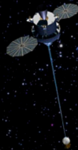
2023 Artificial gravity testbed 180 days Low Earth Orbit